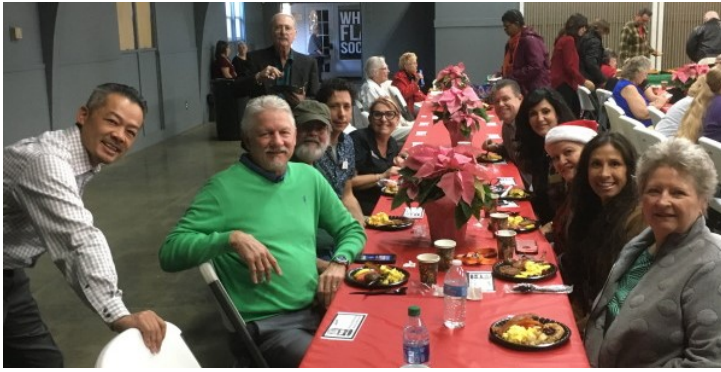
THE MOVERS & SHAKERS