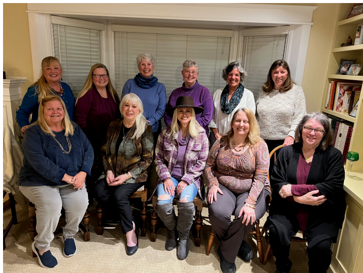
The Evening Section with Author Shiela Lowe