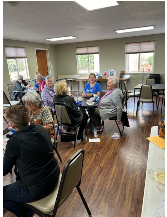
The Canasta Gang