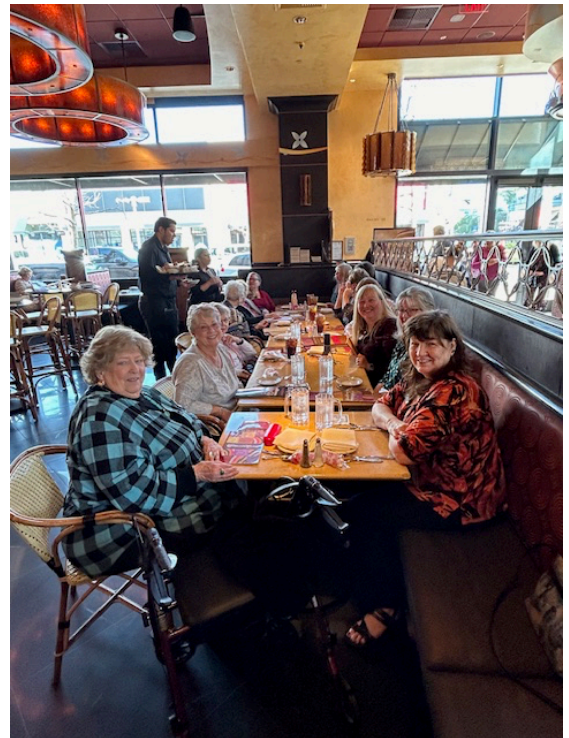
Garden of Eatin' at the Cheesecake Factory