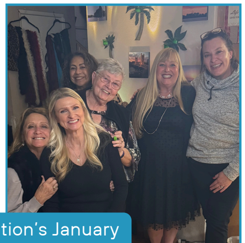
Evening Section's January Strike-A-Pose Glam Night Beauties 1/16/25