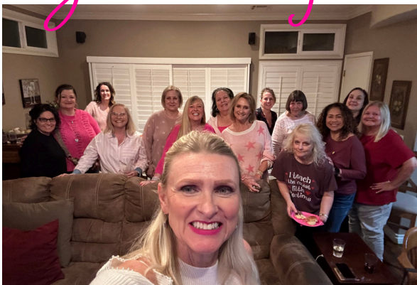
Our Evening Section enjoyed a hilarious game of Rom Com Trivia and each other's company