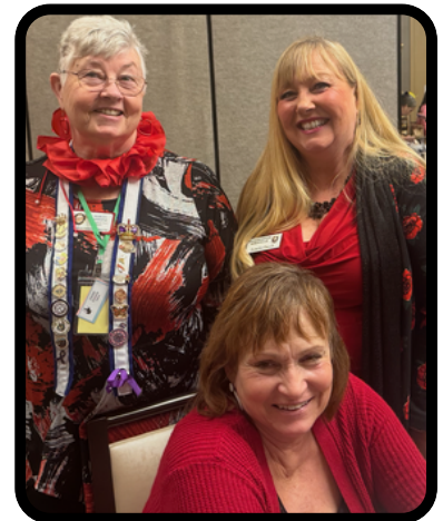
CFWC Winter Executive Board Meeting in Glendale