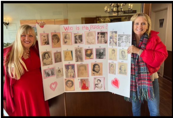
Your Fundraising Committee hard at work. What a great activity!