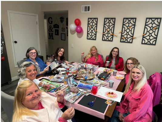
Evening Section's Pretty in Pink Vision Board Night