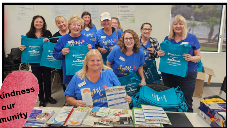
Aut2Run Swag Bag Stuffers