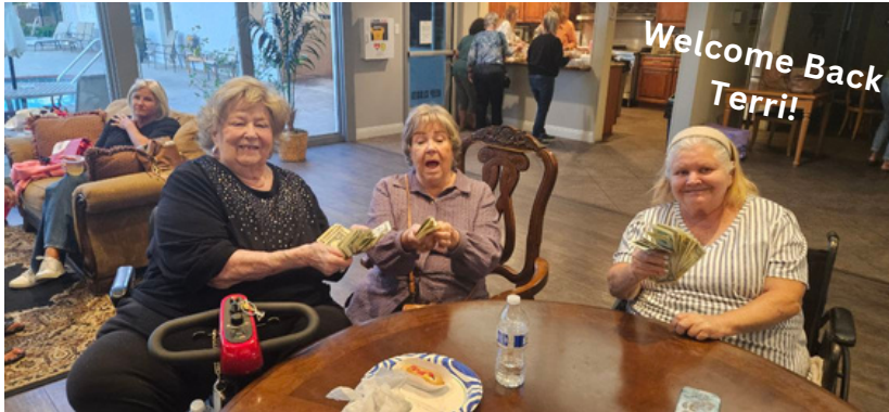
Evening Section's Left, Right, Center Game Winners